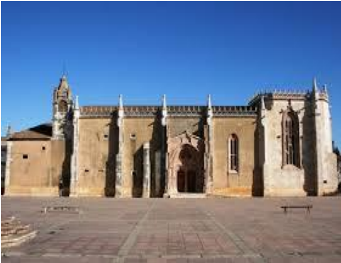
Requalification and preservation of the Convent of Jesus (national monument)