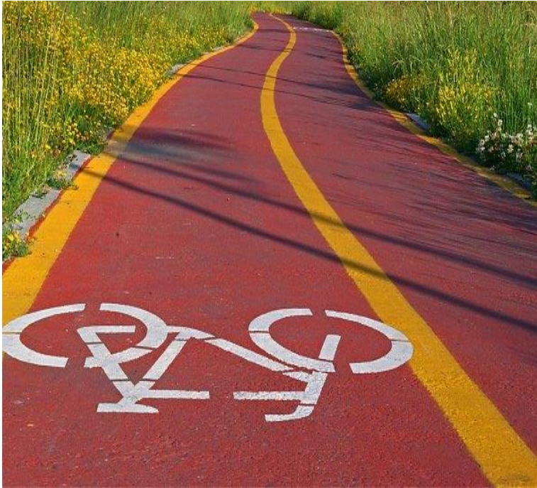
Intermunicipal network of bicycle paths - Project CICLOP7