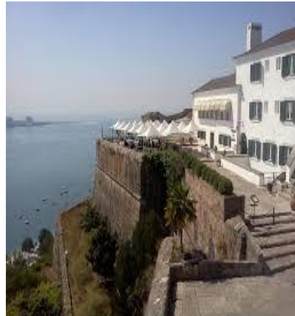
Stabilization of the slope of the Fortress of S. Filipe